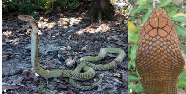
Figure 1: A) A representative specimen of a king cobra, Ophiophagus hannah and its ability to rear up approximately one third of its length. It can grow to more than 5 metres long being the largest venomous snake in the world; B) The typical large 'butterfly' shaped occipital scales on a king cobra's head